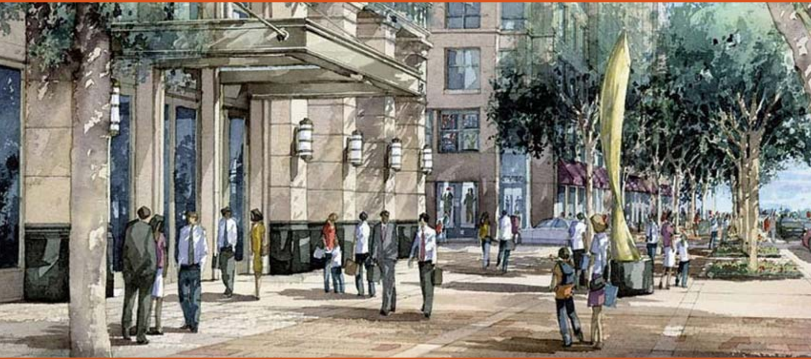
K Street Promenade