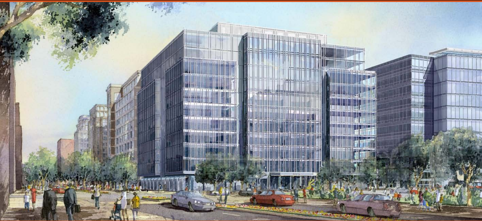
300 K Street