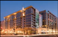
3. CityVista Urban Lifestyle Safeway/ Retail