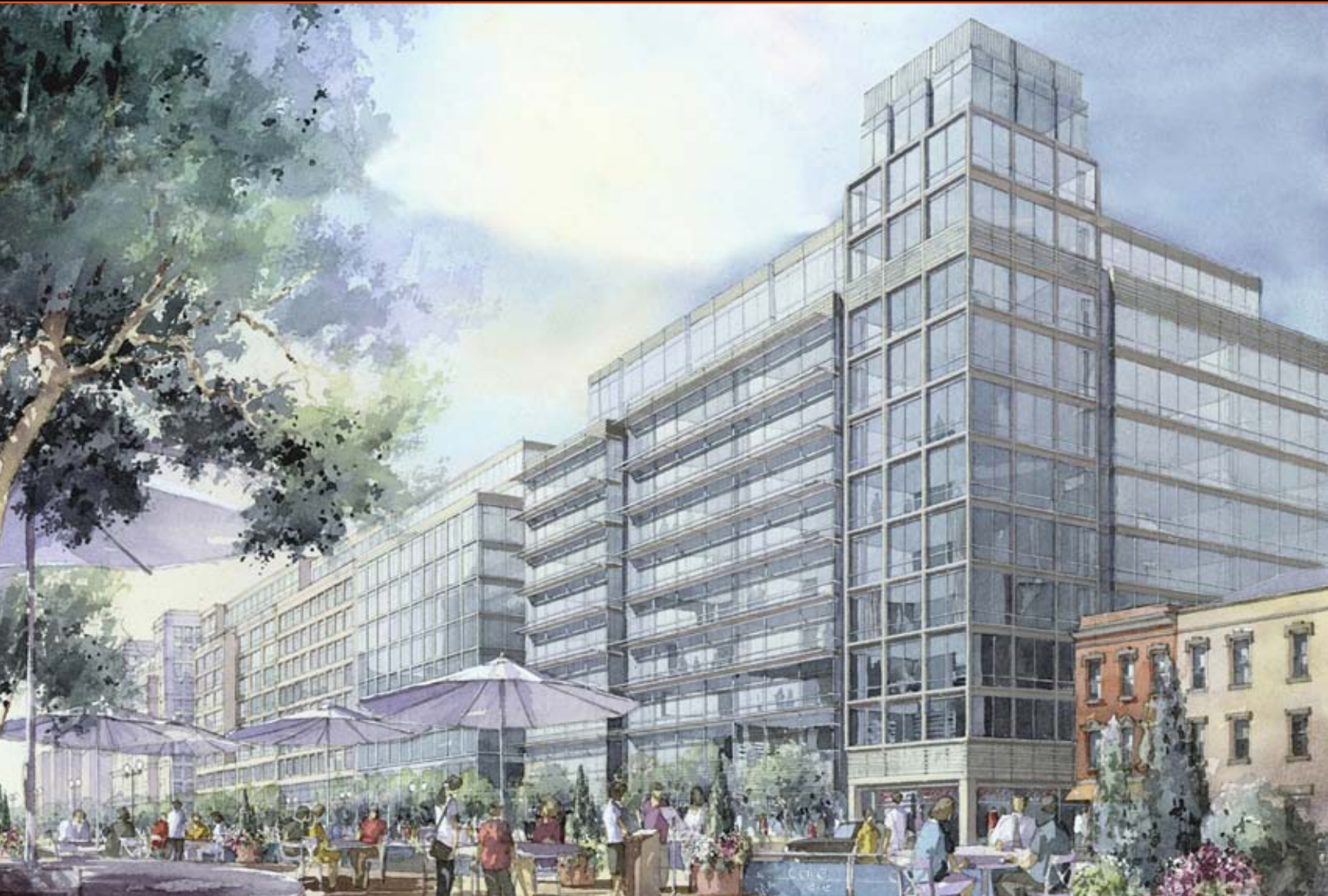
K Street Promenade