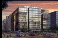
6. 300 K Street