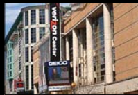
10. Verizon Center