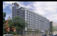
8. 455 Massachusetts Avenue