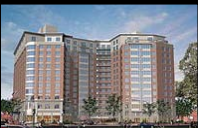
4. 555 Massachusetts Avenue