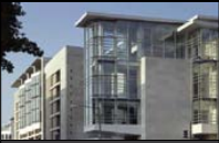
1. Washington Convention Center