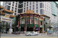
5. Gallery Place