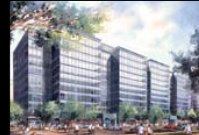
7. 400 K Street